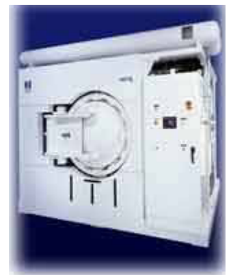
Dry cleaning machine