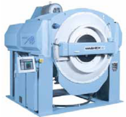
Large open pocket, end-loading washer/extractor

Air-quality concerns are causing the commercial dry-cleaning industry to change technologies and processes.